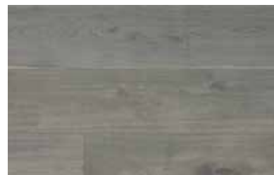
OAK – GREY 15/4 x 189 x 1860mm Brushed