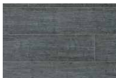
DARK GREY 12 x 125 x 1850mm Brushed