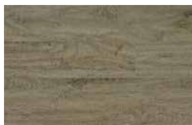
JD157-2 3.0/0.5 x 152.4 x 1219.2mm BP emboss