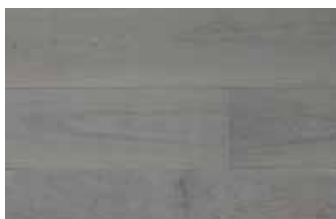
OAK – WHITE 15/4 x 189 x 1860mm Brushed