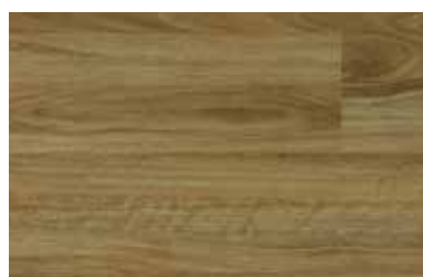
JD166-5 3.0/0.5 x 152.4 x 1219.2mm BP emboss

Our Luxury Vinyl Tile Collection offers a wide range of planks at affordable prices, ensuring something for everyone. Choose from a variety of design strips and borders.