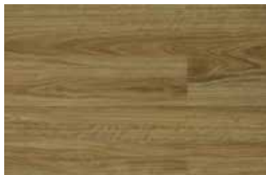
OAK – HONEY 15/4 x 189 x 1860mm Brushed

Our beautiful wood flooring collections gives the look of real timber in a variety of colours and designs – adding warmth and texture. Exceptional decorative colours.