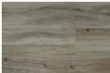
JD223 5.0/0.5 x 184 x 1220mm BP emboss, click