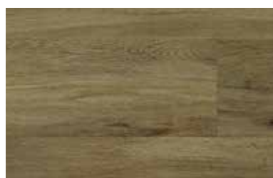
JD222 5.0/0.5 x 184 x 1220 BP emboss, click