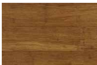
EXPRESSO 12 x 125 x 1850mm Smooth