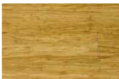
NATURAL 12 x 125 x 1850mm Smooth

Offering a totally different look, only limited by your imagination.