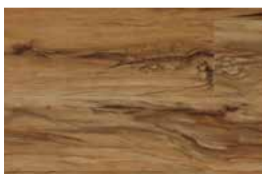
JD006 3.0/0.5 x 152.4 x 1219.2mm BP emboss