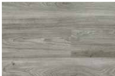
JD117 5.0/0.5 x 184 x 1220 BP emboss, click