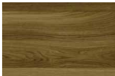
OAK – NATURAL 15/4 x 189 x 1860mm Smooth