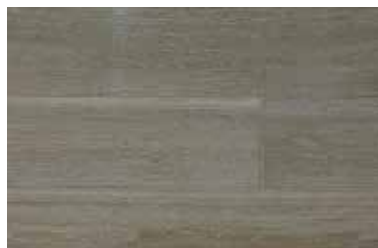
OAK – DANCE OF HEAVEN 15/4 x 189 x 1860mm Brushed