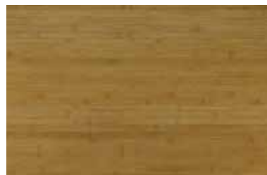
HORIZONTAL – WINCHESTER 15 x 96 x 960mm