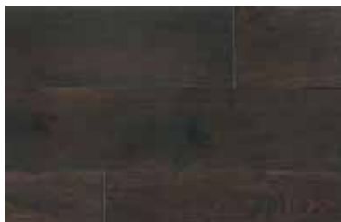
OAK – BROWN 15/4 x 189 x 1860mm Brushed