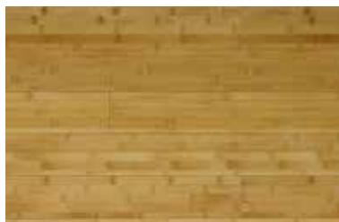
HORIZONTAL – NATURAL 15 x 96 x 960mm

Offering a feeling of purity – walking in a rainforest, enjoying the green landscape, taking in the fresh air – feeling the breeze.