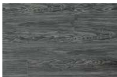
JD020 5.0/0.5 x 184 x 1220 BP emboss, click