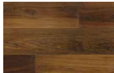
OAK – CARBONIZED 15/4 x 189 x 1860mm Brushed