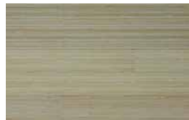
VERTICAL – NATURAL 15 x 96 x 960mm