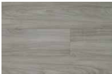
JD001 5.0/0.5 x 184 x 1220 BP emboss, click