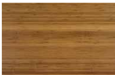
VERTICAL – GUNSTOCK 15 x 96 x 960mm