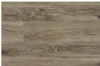
JD275 3.0/0.5 x 152.4 x 1219.2mm BP emboss