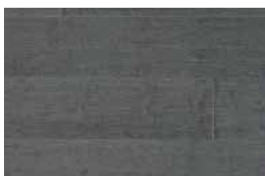
LIGHT GREY 12 x 125 x 1850mm Brushed